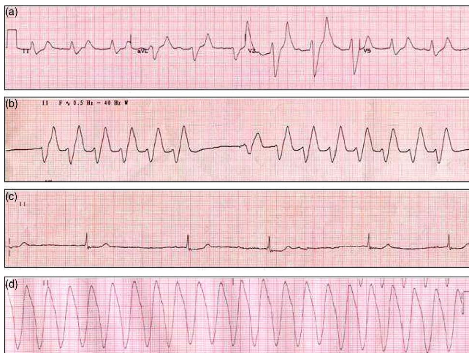
Figure 1 Life-threatening ECG changes in hyperkalaemia. (a) Illustrates tented T waves, loss of P waves and a wide QRS complex in a patient presenting with paralysis and acute renal failure (serum K 9.3 mmol/l). (b) Illustrates a sine-wave pattern in a patient with acute renal failure and digoxin toxicity (serum K 9.3 mmol/l). (c) Illustrates a severe bradycardia at a rate of 28 beats/min in a haemodialysis patient presenting with syncope (serum K 8.1 mmol/l). (d) Illustrates ventricular tachycardia in a haemodialysis patient presenting with generalised weakness (serum K 9.1 mmol/l). The paper speed is 25 mm/s.

There is some degree of overlap of ECG features in hyperkalaemia. As serum potassium rises above 7 mmol/l, more than one abnormality may be present. The risk of cardiac arrest increases with rising serum potassium and the presence of ominous ECG signs indicated above.